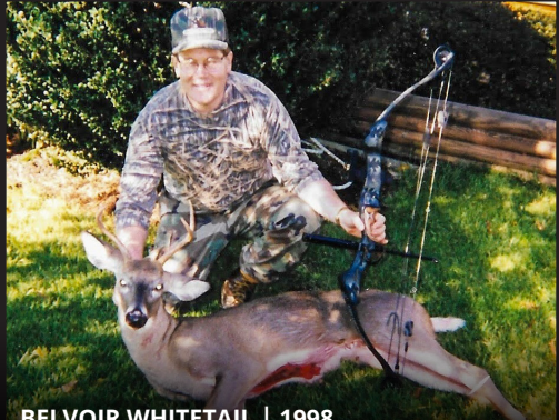
BELVOIR WHITETAIL | 1998