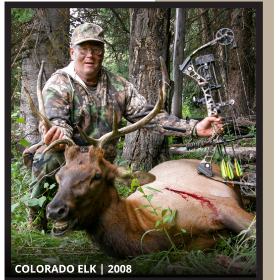
COLORADO ELK | 2008