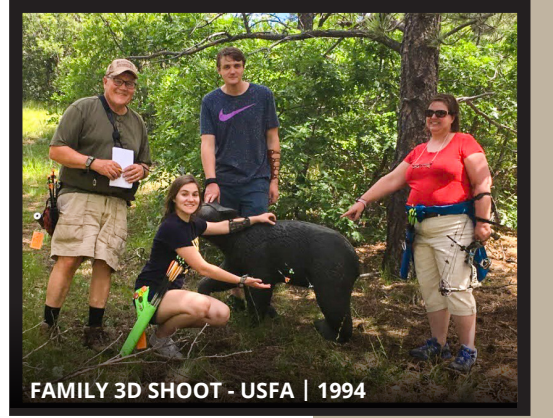
FAMILY 3D SHOOT - USFA | 1994