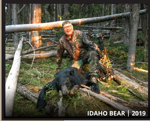
IDAHO BEAR | 2019