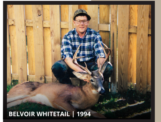
BELVOIR WHITETAIL | 1994