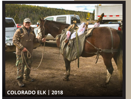
COLORADO ELK | 2018